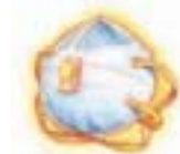
Respirator as needed