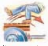
Wagon movement can cause slips and falls