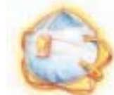
Respirator as needed