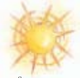
Sun can cause heat exhaustion