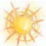
Sun can cause heat exhaustion