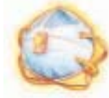
Respirator as needed