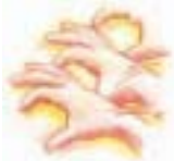
Repetitive motion can strain muscles and injure back and joints